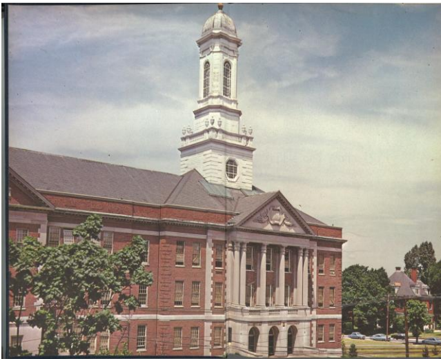
Hope High School, a “good” school

Even with students who had been in our large school system over their school years, learning was variable. This was certainly so for students who moved in from another district, another state, often the transient low income students. Within our own school and departments learning varied. There was no commonality within a grade level or over the grades. It’s no wonder that achievement was less than proficient. Demographics largely determined what students knew, or didn’t know. Some could read and write when they came into our classes; others couldn’t.