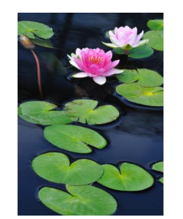
Figure 1 two water lily blooms

<sup>1</sup>one – a person; anyone <sup>2</sup>dimensions – sizes, features